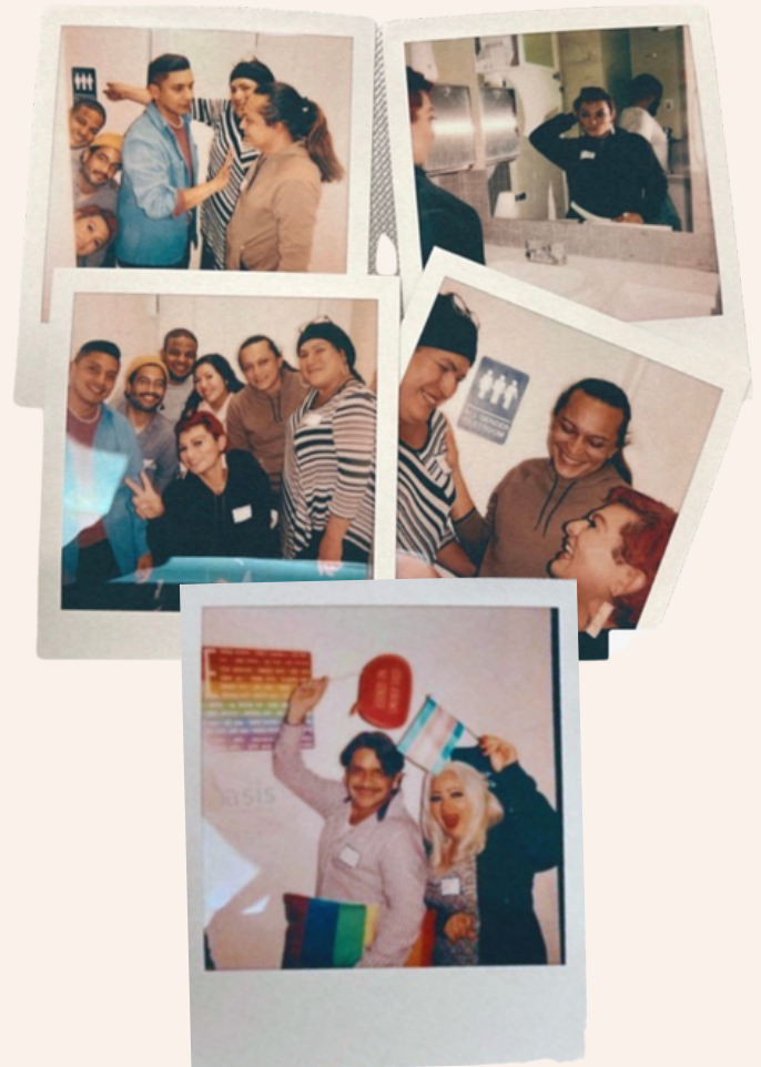
*Polaroid photos produced at a "Healing through Art" Zero event.

Zero hosts events throughout the year with annual campaign dates corresponding with the International Day Against Homophobia, Biphobia, and Transphobia, observed every year on May 17, and with the International Transgender Day of Remembrance, commemorated annually on November 20.